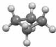
Model of cyclobutane showing the puckered ring - courtesy of Jeff Deschamps.

More than thirty years later, when bent bonds had become fashionable and had showed up in Bader's theory of chemical bonding, this definition received a seal of approval when it was reproduced in one of Bader's papers. Not many sentences in the scientific literature are deemed to be worth repeating after thirty years.